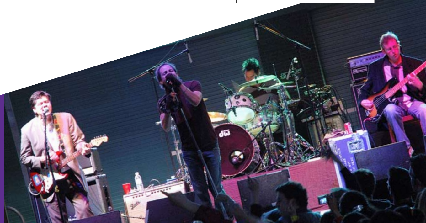
The Gin Blossoms performed at Crystal Rocks.