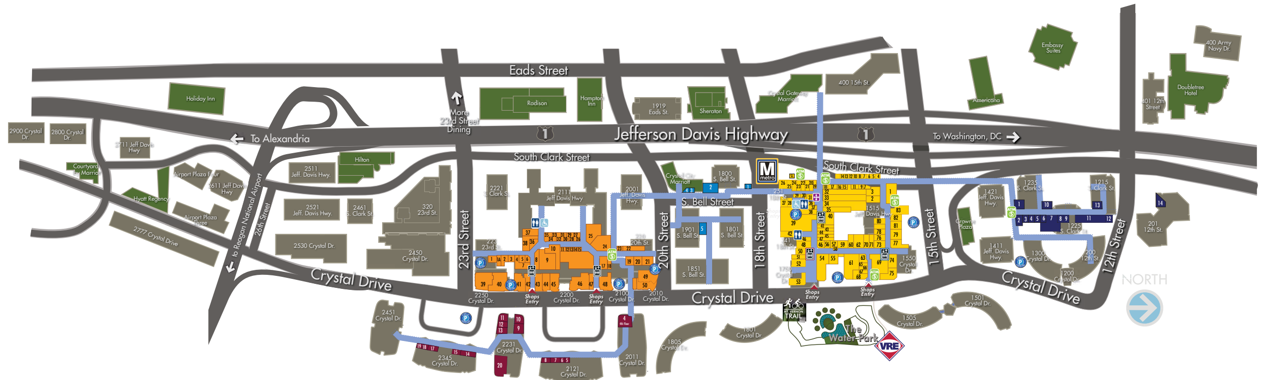
Crystal City Bid Boundary Map